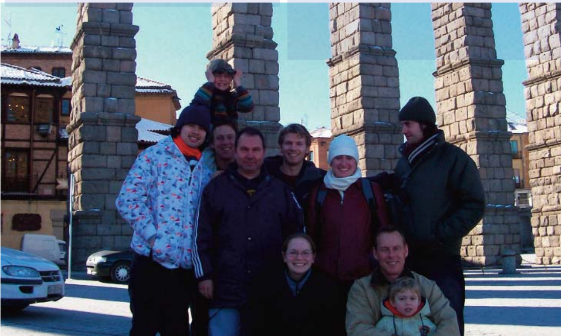
Canterbury Club in Segovia!

Patones is one of the most picturesque Spanish villages in the Community of Madrid. All the houses are made of slate (pizarra) with red tile roofs (tejados de tejos). The streets of grass and cobblestones (adoquines) wind delightfully around the village. Patones is isolated from the rest of civilization, nestled (anidado) among the rolling (ondulante) green hills of the Sierra Pobre of Madrid. The village seems to be lost in time and you almost expect (casi esperar) Rip Van Winckle to appear from behind the rustic village cemetery, or to see a shepherdess (pastora) dressed in 18th century clothes, scrubbing (frotando) her dresses on the stones at the open air washing place (lavadero) next to the stream (riachuelo), where four centuries of villagers have washed and rinsed (esclarecido) their clothes.