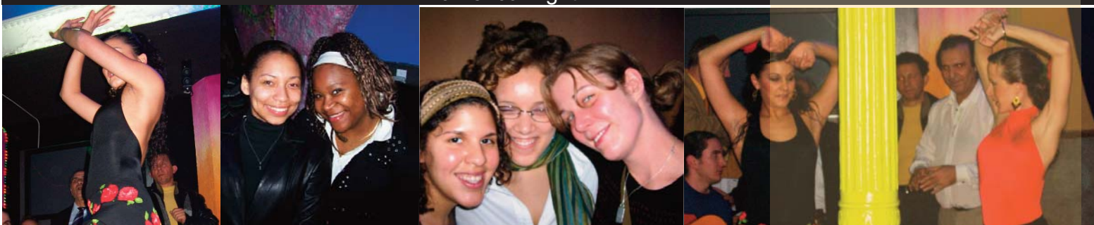
Experiencing an intimate and emotional flamenco show for the first time.